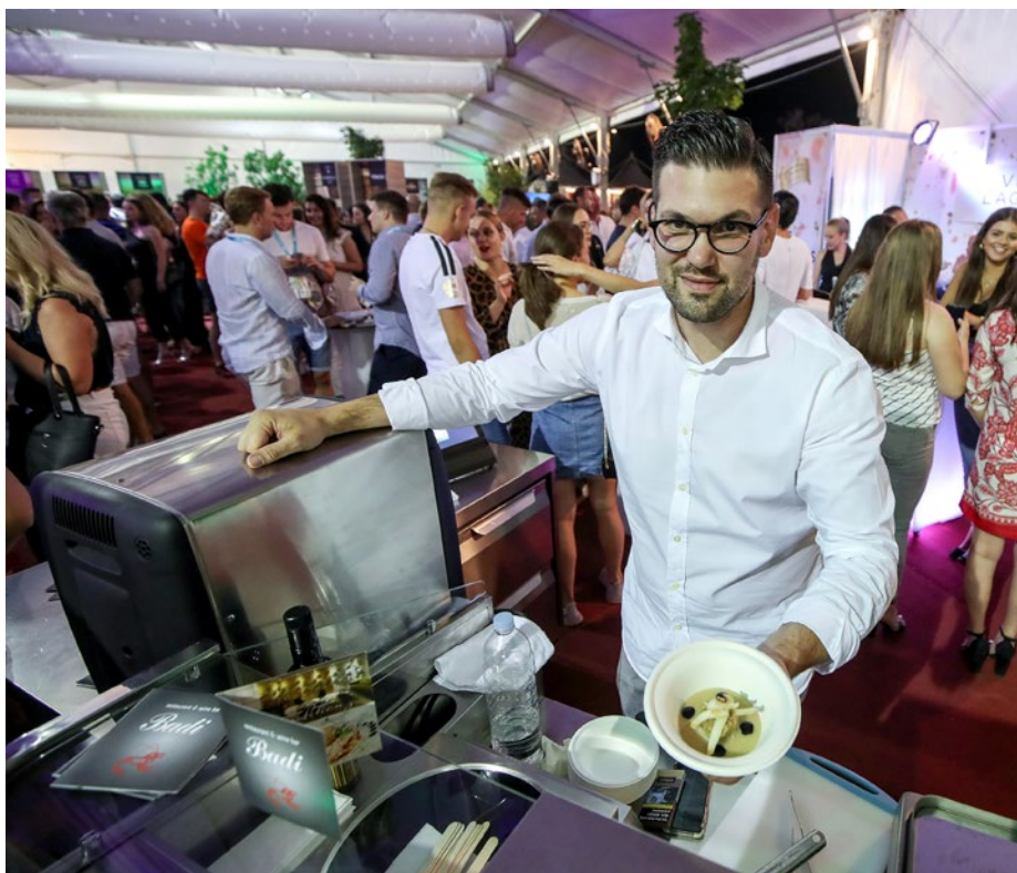
ISTRIA GOURMET FESTIVAL: BADI RESTAURANT