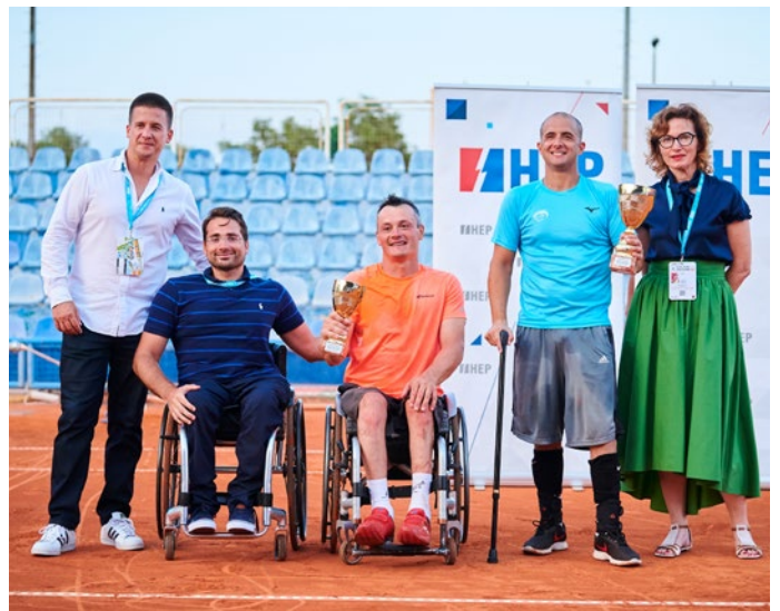
ITF WHEELCHAIR TENNIS CROATIA OPEN UMAG BY HEP