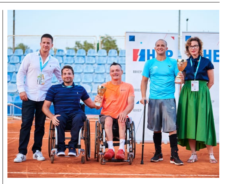
ITF WHEELCHAIR TENNIS CROATIA OPEN UMAG BY HEP