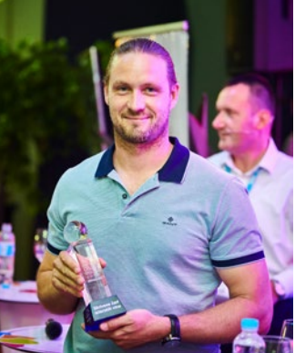
best sparkling wine of this year's tournament will be selected today at 9PM at the Taste Istria zone.

After rating the appearance, bouquet and flavour of the wines offered, visitors gave the most points to Novacco's excellent 2018 Sauvignon Blanc, which thus became the fourth finalist for ATP wine of the year. The